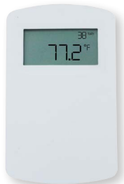
North American style

NDIR CO 2 Sensor, Universal CO 2 /RH Outputs, Optional Relay